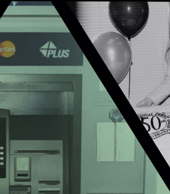
TWIN CITY COMMUNITY CU