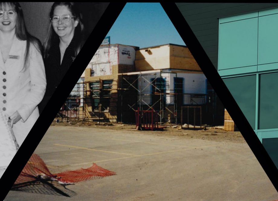
GRAND RIVER CU